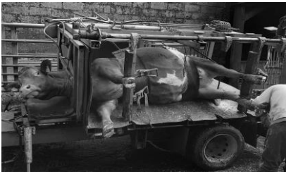
Turn - Over Crate

Some cows need their feet trimmed, we use a professional foot trimmer who brings a Turn- over crate, this gently lifts the cow and lies it on its side so all four feet are easily accessible, a stressless procedure for all concerned!